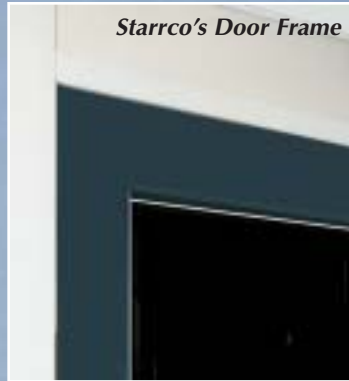
Starrco's Door Frame

The wide variety of materials and finishes is an important part of the Starrco Advantage. It lets you create a modular office system that reflects the function and individual "look and feel" of your company.