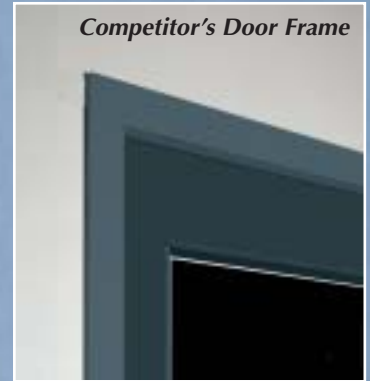
Competitor's Door Frame