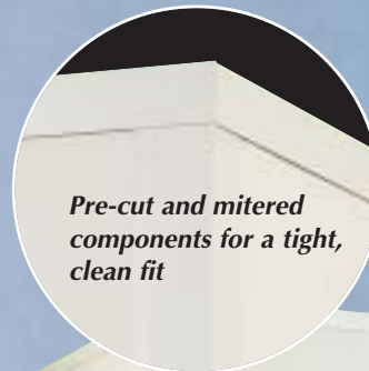
Pre-cut and mitered components for a tight, clean fit