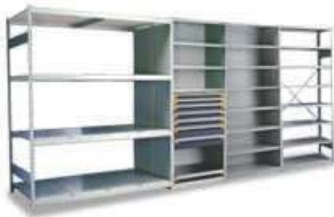
ROUSSEAU SPIDER SHELVING