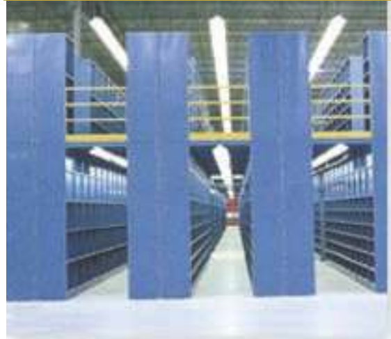
SHELVING SUPPORTED MEZZANINE