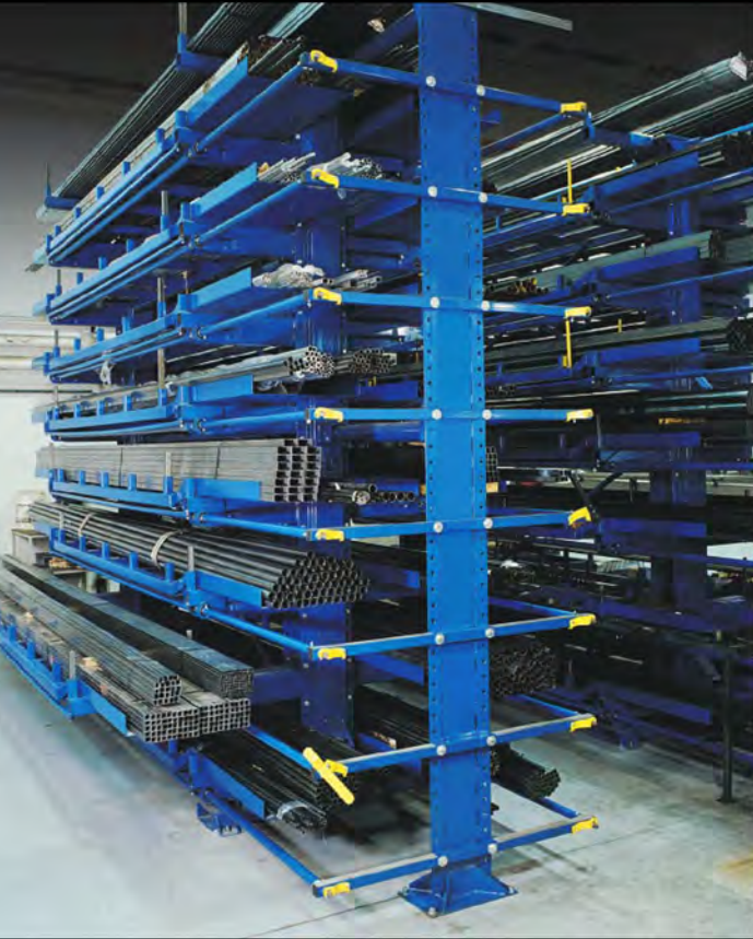
▲ Double-sided cantilever rack shown